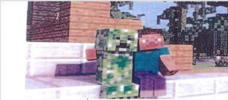
the creeper is exploding